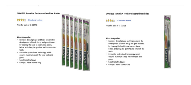
Figure 2: Depiction of consistent (left) and inconsistent (right) description and image for a pack of six toothbrushs.

A study of Lee and Choi (2019) considered the impact on product evaluations (Y, prodeval) of consistency of product description, denoted X, a binary factor with two levels, either consistent (0, reference) or inconsistent (1) when the image did not match the description — see Figure 2. Because the authors expect people familiar with the brand (as evidenced by higher familiarity scores, Z) to have higher reviews, they included the latter as a covariate in an analysis of covariance (ANCOVA).